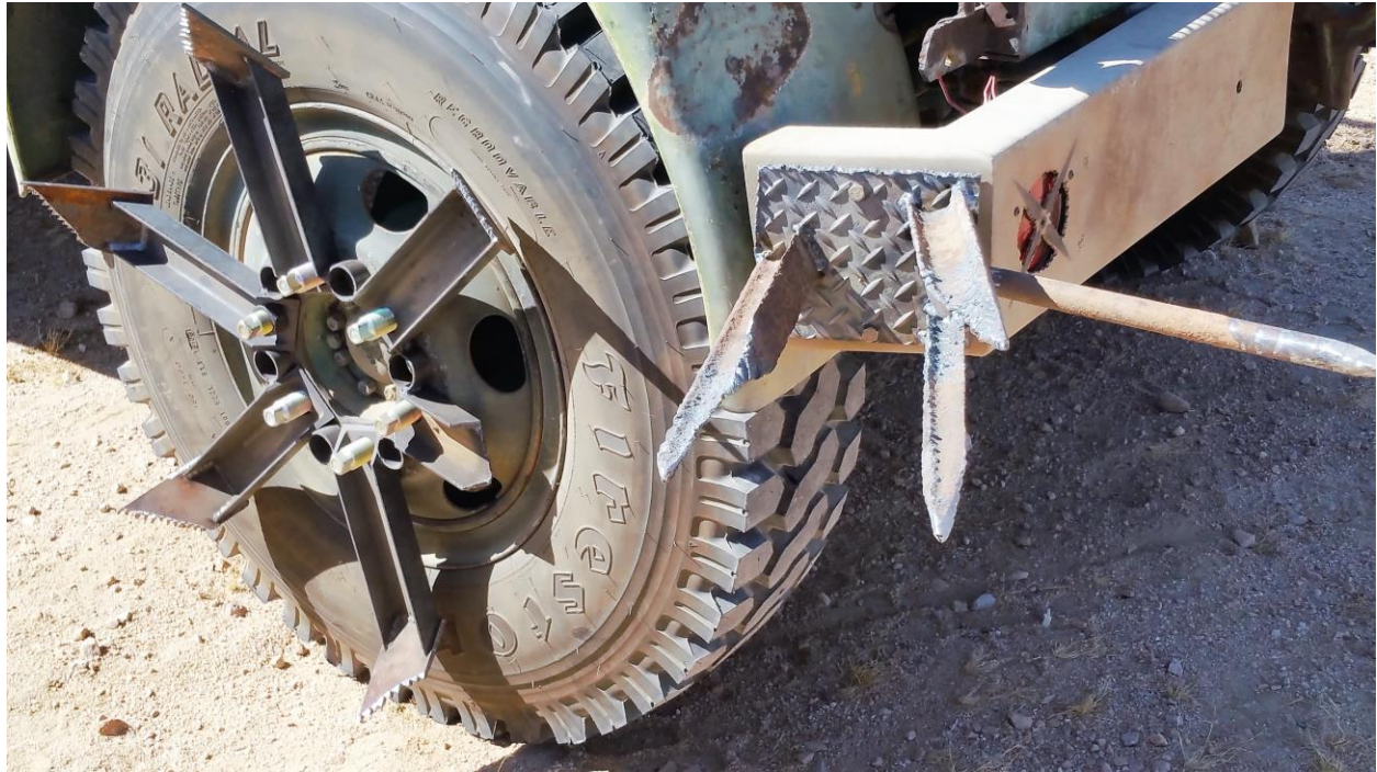
Tail Spikes in progress.